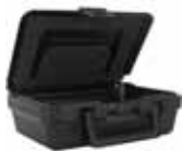
Protective Carrying Case