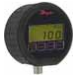
DPG-100 with Protective Rubber Boot